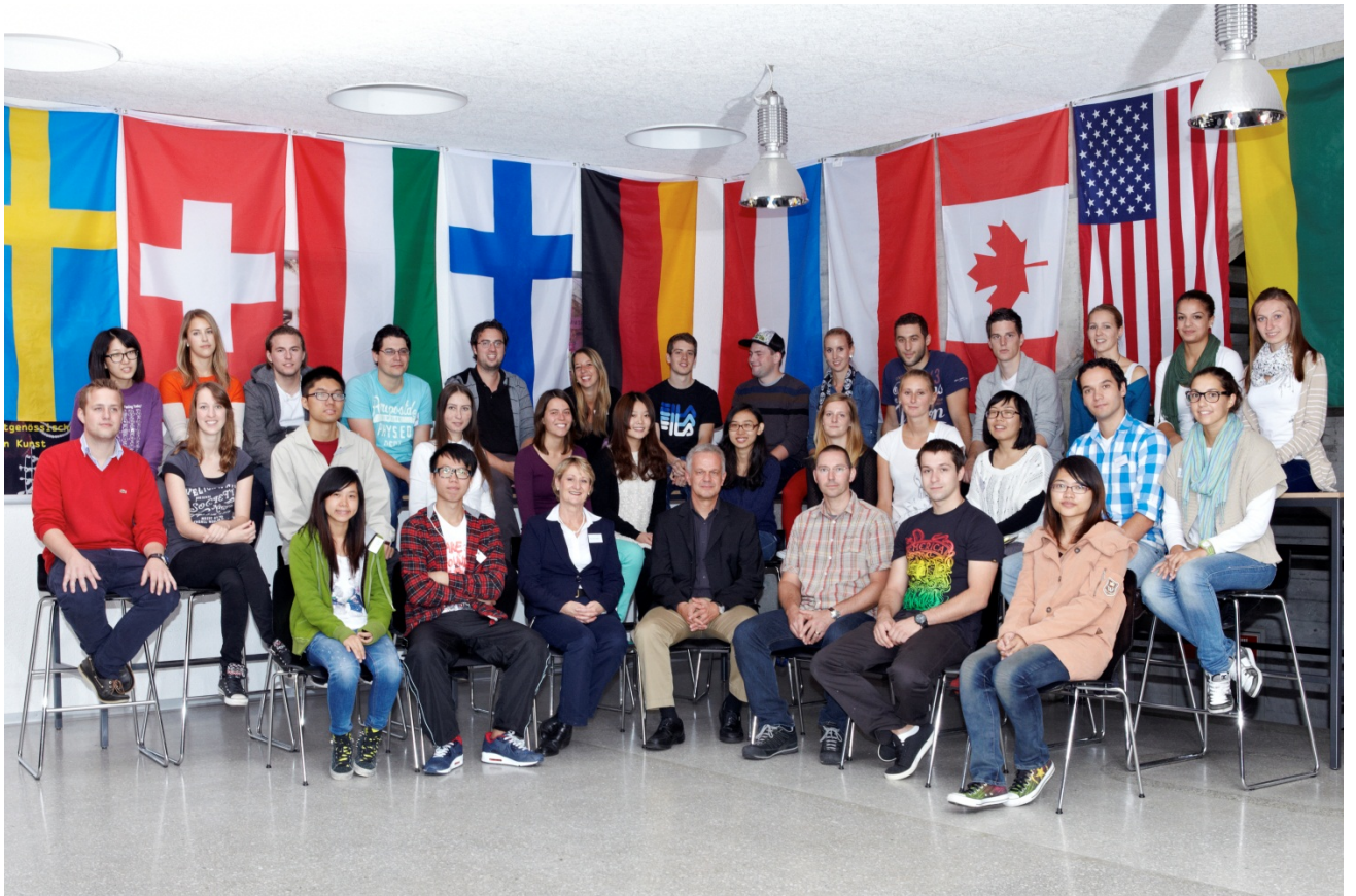
International Students Autumn 2012/13